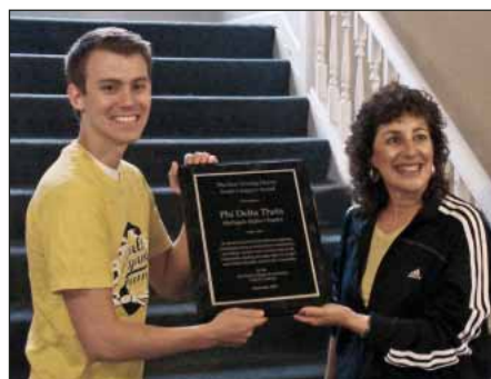
Michigan Alpha receives the "Unsung Heroes" award from the Ann Arbor Campus Community Coalition (A2C3).

In response to legal, insurance, and student health concerns, the PDT General Headquarters mandated that all chapters of the fraternity established alcohol-free chapter houses as of the year 2000. With oversight by the Michigan Alpha Housing Corporation, the active chapter has adhered to GHQ's policy since it reactivated in the fall of 2004.