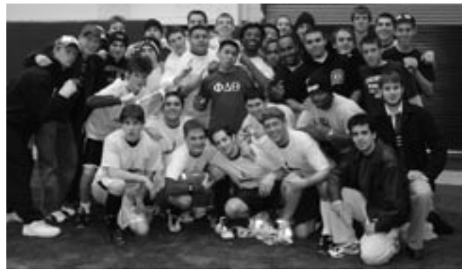
Fall 2005 Mud Bowl Participants