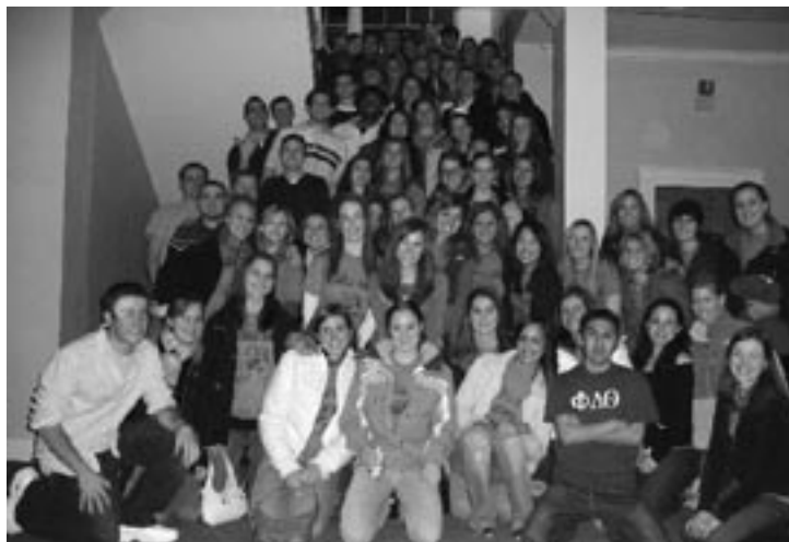
Phi Delta Theta and the Delta Gamma sorority participated in the first annual Banta Bash .

I would like to thank all my brothers for another successful year. With hard work, we shall continue to strive to be a healthy and vibrant Chapter for years to come.