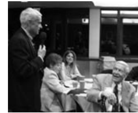
Founder's Day Ceremony recognized some of our alumni by the presentation of Silver, Gold and Palladian Legion awards

Lastly, I want to highlight a "first" for Michigan Alpha: We have been invited to participate in the Ann Arbor Women's City Club 54th Annual Home Tour. 1437 Washtenaw is on the tour! If you are in Ann Arbor on Friday, May 19th, from 10:00 AM to 6:00 PM, you will need a ticket to get into the House! The mere fact that a fraternity house in Ann Arbor has been asked to participate is monumental. And that it is our House, says a lot about what we have been doing over the last several years, both in renovation efforts and the major change in lifestyle brought about by alcohol-free housing.