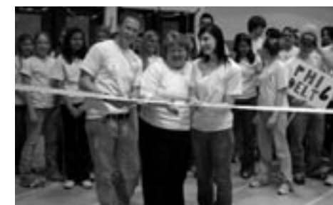
Pi Beta Phi and Michigan Alpha initiate a new fundraiser.

The event will continue to be Michigan Alpha's main philanthropy event in the upcoming years.