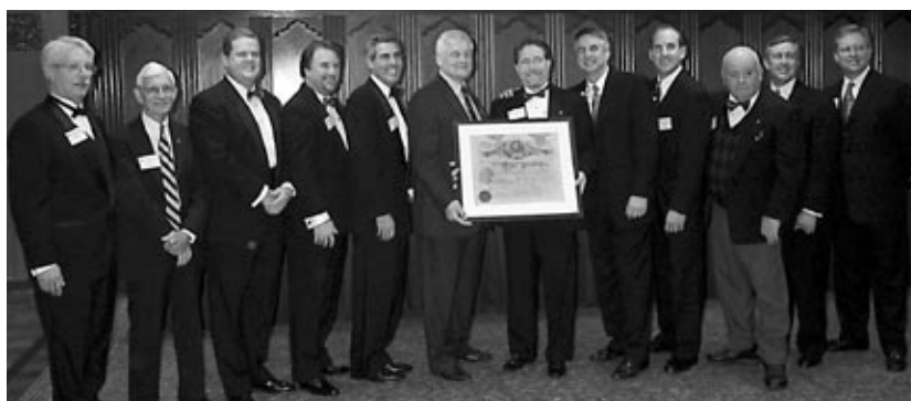
Alumni leaders holding the restored Charter

President, Michigan Alpha Alumni Association ■